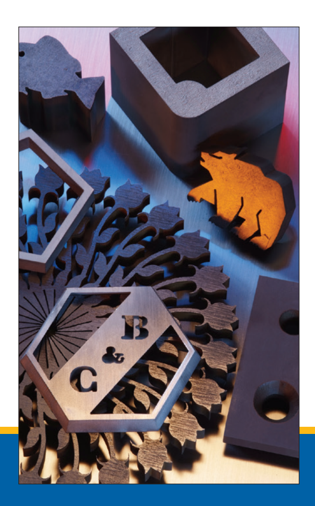
A few examples of some of the zero taper intricate parts that can be achieved with the Dynamic XD Waterjet.