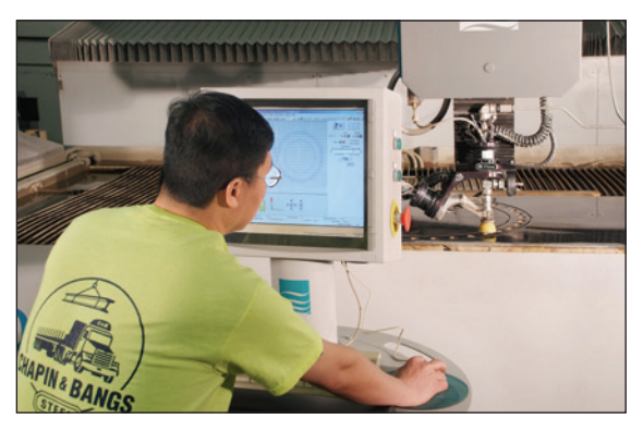
All Waterjet functions are controlled from the digital console.

Dynamic XD Waterjet is the only 3-dimensional cutting system that utilizes SmartStream<sup>™</sup> technology providing higher accuracy, faster cutting and virtually no taper.