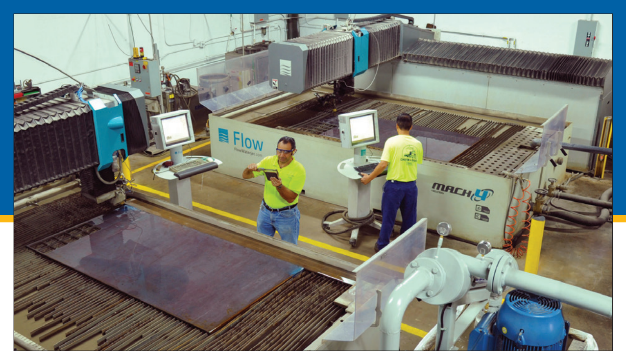
The dual Dynamic XD Waterjets cut any material with virtually zero taper (.001).