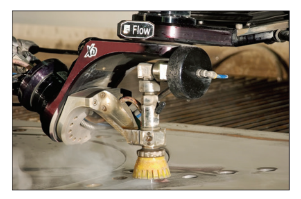
The powerful 94,000 psi (100 HP) HyperJet intensifier pump reduces cutting time by half.